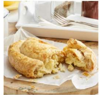
CHEESE & ONION PASTY