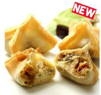
FIG & GOATS CHEESE PARCELS