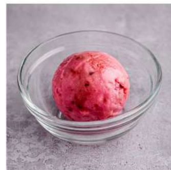
PLUM & DAMSON SORBET