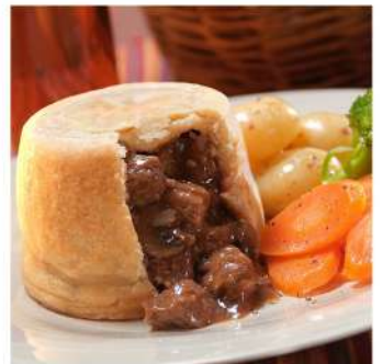
STEAK, ALE & MUSHROOM SUET PUDDING