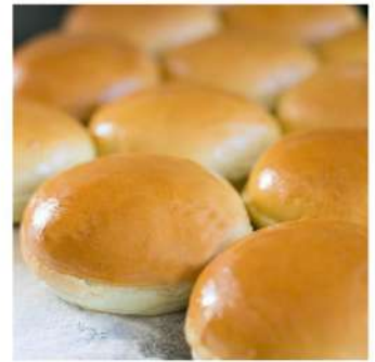
GOURMET GLAZED BRIOCHE BUNS