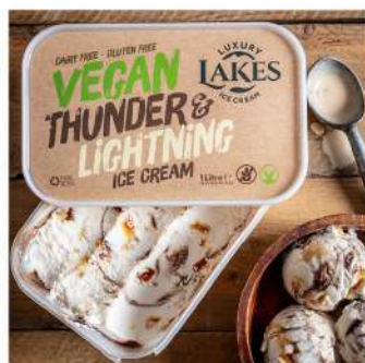
THUNDER 'N' LIGHTNING