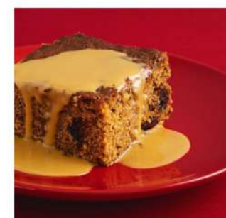
STICKY TOFFEE SPONGE WITH BUTTERSCOTCH SAUCE