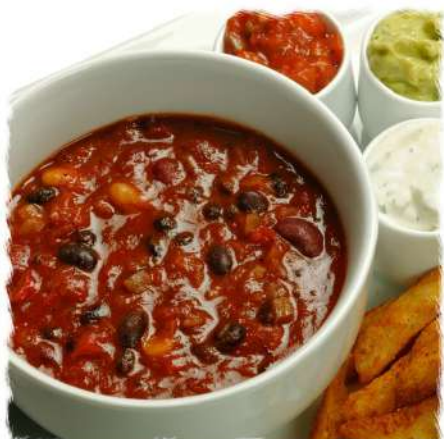
CHILLI CON CARNE