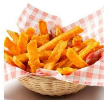
SWEET POTATO FRIES