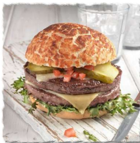
U.S. SEASONED BEEF BURGERS