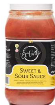
SWEET & SOUR SAUCE