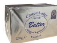
UNSALTED BLOCK BUTTER