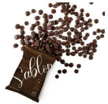
DARK CHOCOLATE CALLETS