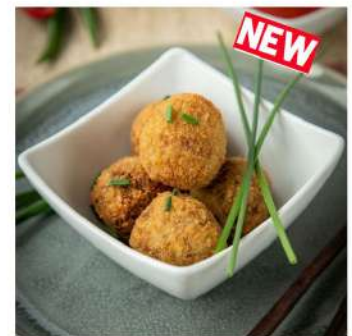
CHINESE STYLE DUCK BON BONS