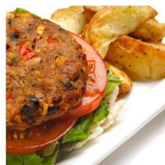
CAJUN VEGETABLE BURGER