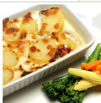
BROCCOLI & CREAM CHEESE BAKE