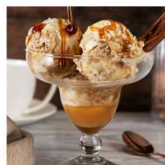
CARTMEL STICKY TOFFEE PUDDING