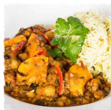
SWEET POTATO & SPINACH CURRY