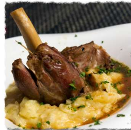
LAMB SHANK IN MINT & ONION