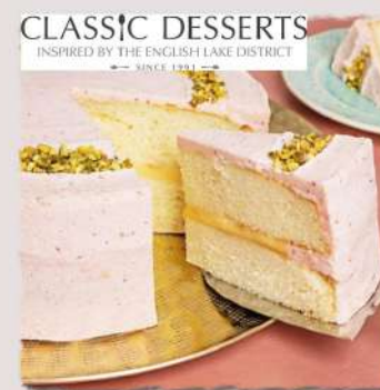
RASPBERRY & LEMON CAKE