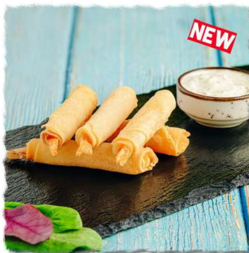
ORIENTAL FILO PRAWNS