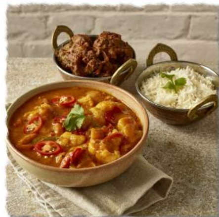
CAULIFLOWER & RED PEPPER CURRY