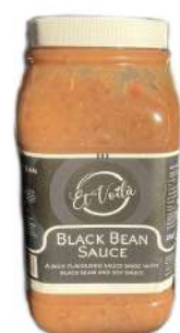
BLACK BEAN SAUCE