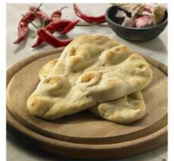
MINI TEAR DROP NAAN