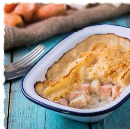
LUXURY FISHERMAN'S PIE