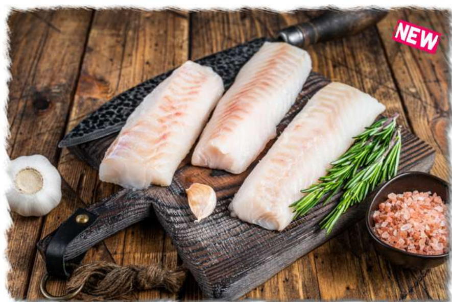
PACIFIC COD FILLET PORTIONS