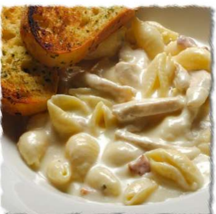
CHICKEN & SMOKY BACON PASTA