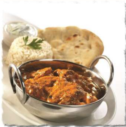
CHICKEN TIKKA MASALA