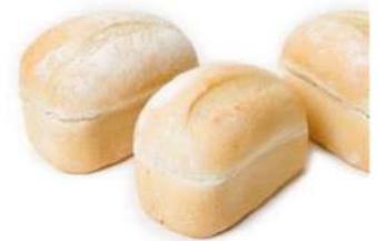
MINI TIN LOAVES