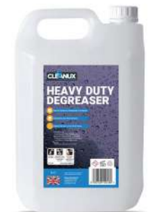
HEAVY DUTY DEGREASER