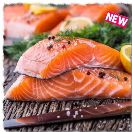
SALMON FILLET PORTIONS