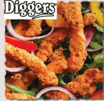
SALT 'N' CHILLI SHREDDED CHICKEN