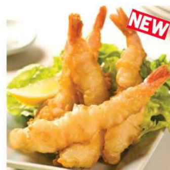
TEMPURA BATTERED PRAWNS