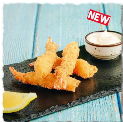
BREADED TORPEDO PRAWNS