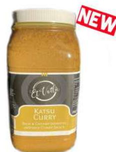
KATSU CURRY SAUCE