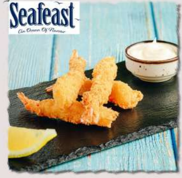
BREADED TORPEDO PRAWNS