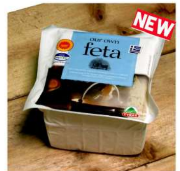
GREEK STYLE FETA