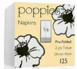
2 PLY WHITE NAPKINS