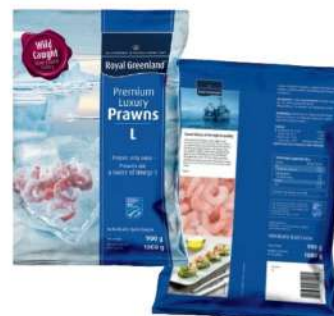
ROYAL GREENLAND PRAWNS