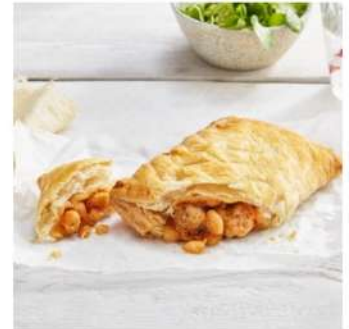
SAUSAGE, CHEESE & BEAN SLICE