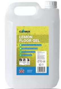
LEMON FLOOR GEL