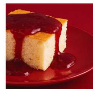
STRAWBERRY JAM SPONGE