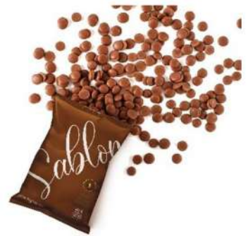
WHITE CHOCOLATE CALLETS