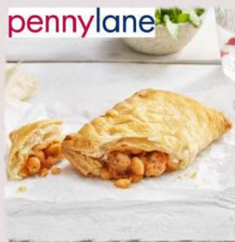
SAUSAGE, BEAN & CHEESE BAKE