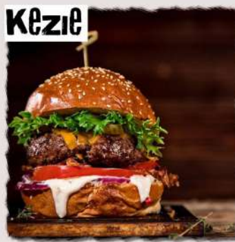
BRITISH WAGYU BURGER