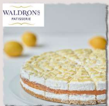
WHITE CHOCOLATE & LIMONCELLO CHEESECAKE