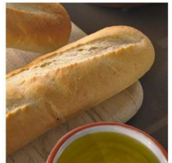
THAW 'N' SERVE BAGUETTE