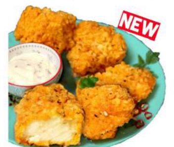
SALT 'N' CHILLI CHUNKS