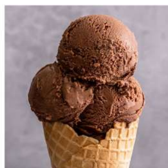
DEATH BY CHOCOLATE