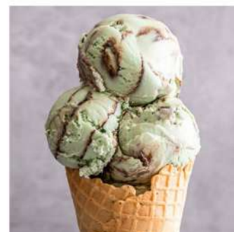
MINT CHOC CHIP