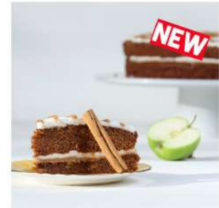
SPICED TOFFEE APPLE CAKE