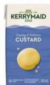
READY TO SERVE CUSTARD