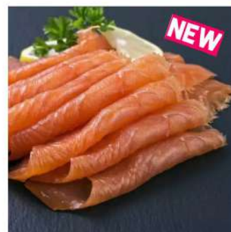
SMOKED SALMON SIDES