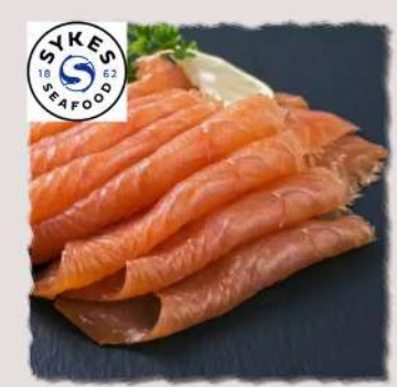
SMOKED SALMON SIDES