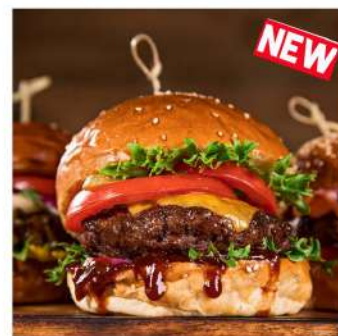
BRITISH WAGYU BURGER