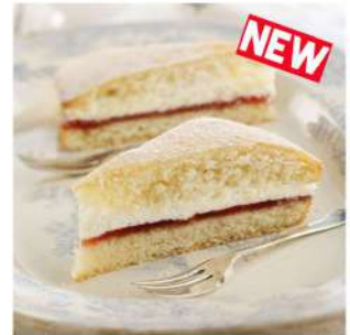
VEGAN VICTORIA SPONGE