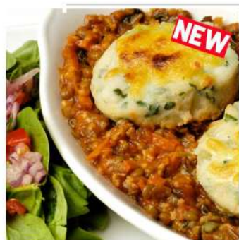
SHEPHERDS PIE WITH BUBBLE AND SQUEAK CAKE