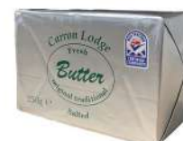
SALTED BLOCK BUTTER