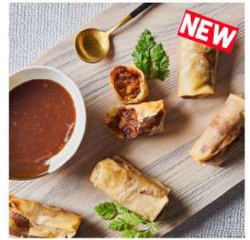
JACKFRUIT SPRING ROLLS