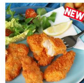
BATTERED CHICKEN CHUNKS