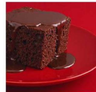
CHOCOLATE SPONGE WITH CHOCOLATE SAUCE