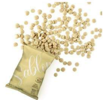
WHITE CHOCOLATE CALLETS