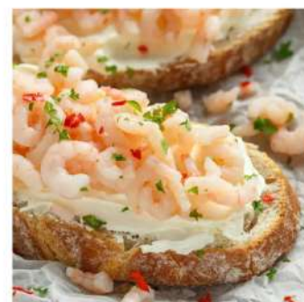
ISLANDER PREMIUM PRAWNS