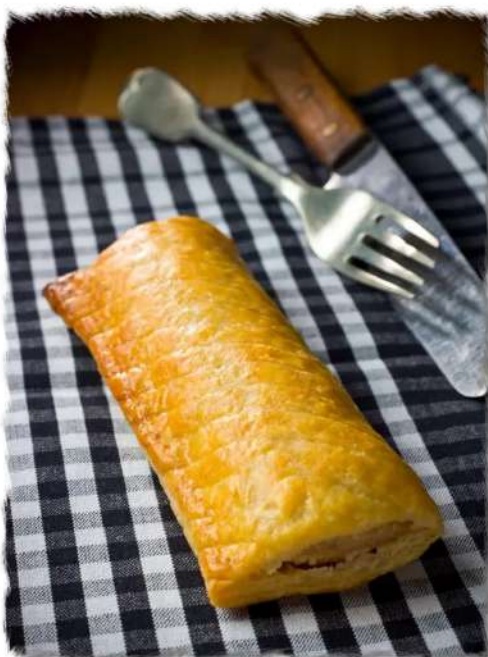
JUMBO BAKED SAUSAGE ROLL