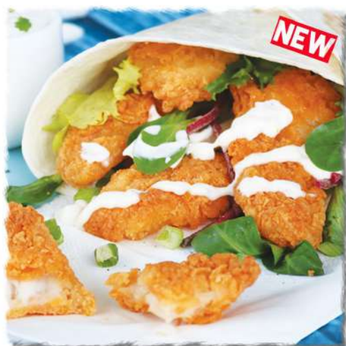
CRISPY FISH GOUJONS