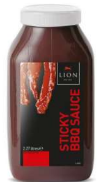
STICKY BBQ SAUCE