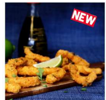
SOY, GINGER & LIME SHREDDED CHICKEN