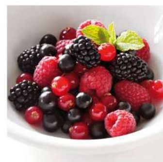
FRUIT BERRY MIX