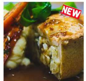
CHICKEN, HAM & WHITE WINE PIE