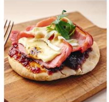
RINDLESS BACK BACON