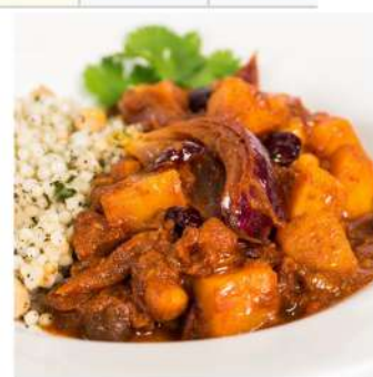
SQUASH, CRANBERRY & RED ONION TAGINE