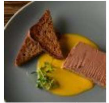
WILD BOAR PÂTÉ